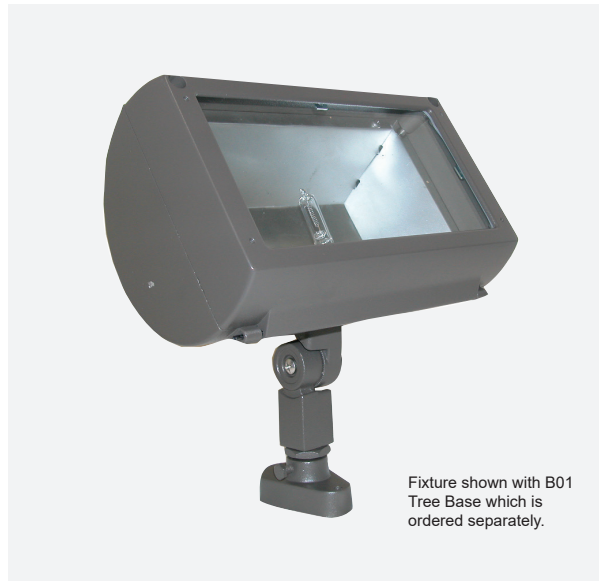
Fixture shown with B01 Tree Base which is ordered separately.